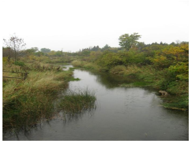
Photograph 14 ↑ Site 5 – Huntley Creek, east side of Oak Creek Road, looking downstream