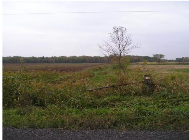
Photograph 2 ↑

Site 1 – Dry area where pool of standing water used to be on the northeast side of William Mooney Road