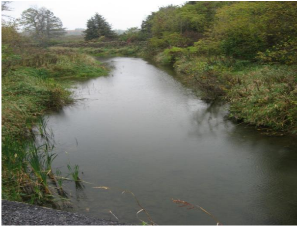
Photograph 13 ↑ Site 5 – Huntley Creek, west side of Oak Creek Road, looking upstream