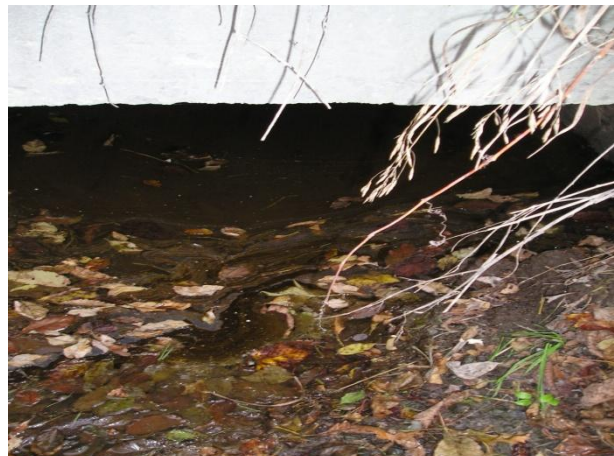
Photograph 6 ↑

Site 3 – South Huntley Creek, west side of Carp Road, "organic" build-up from upstream farm