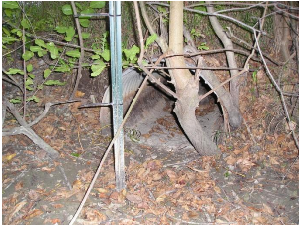
Photograph 1 ↑

Site 1 – Dry area where pool of standing water used to be on the northeast side of William Mooney Road