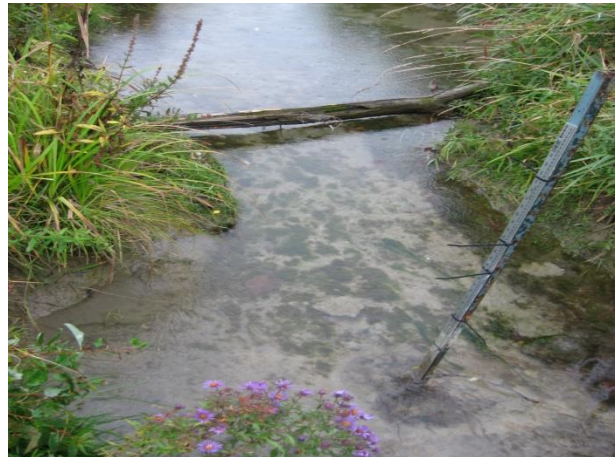
Photograph 12 ↑ Site 6 – South Huntley Creek, west side of Newill Place, stream bottom mainly clay