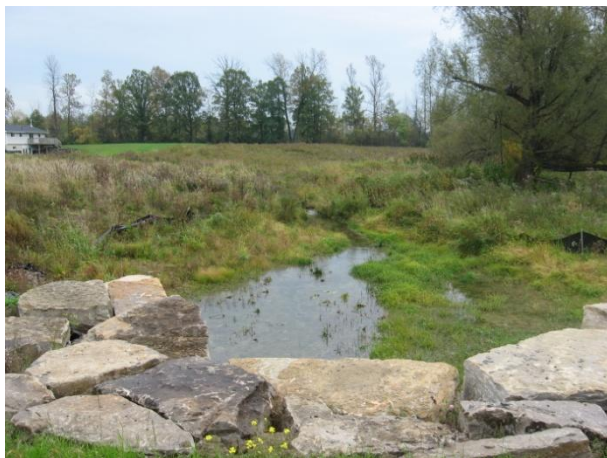
Photograph 9 ↑ Site 6 – South Huntley Creek, west side of Newill Place, looking upstream