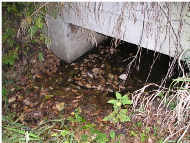
Photograph 5 ↑

Site 2 – Looking downstream, abundant riparian vegetation cover