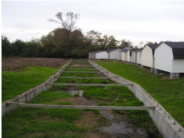
Photograph 7 ↑ Site 3 – South Huntley Creek, west side of Carp Road, looking upstream