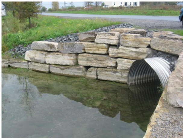
Photograph 11 ↑ Site 6 – South Huntley Creek, east side of Newill Place, large pool of water