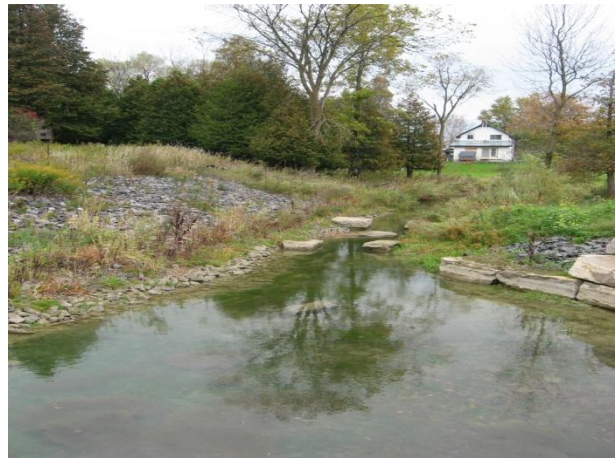
Photograph 10 ↑ Site 6 – South Huntley Creek, east side of Newill Place, looking downstream