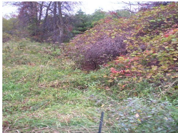
Photograph 4 ↑

Site 2 – Looking upstream, stream flows through farm fields before flowing through culvert