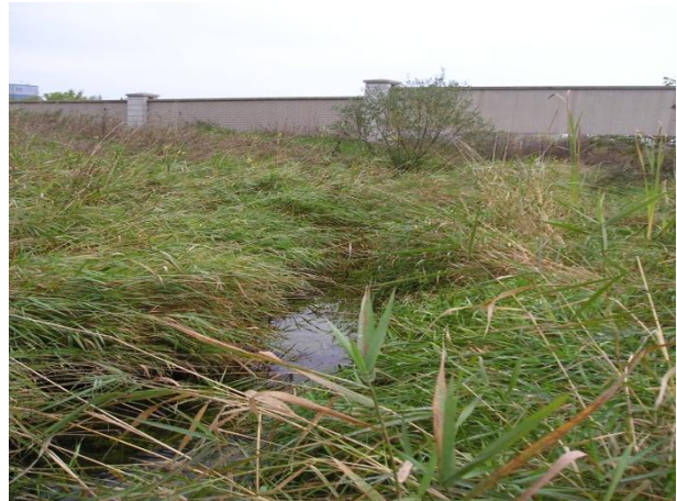
Photograph 8 ↑ Site 3 – South Huntley Creek, east side of Carp Road, looking downstream before stream enters quarry property