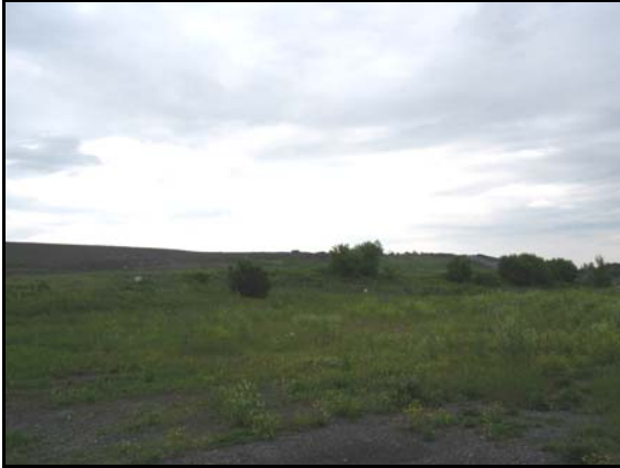
Plate 5: View to south across graded land behind factory. Landfill hill at left.