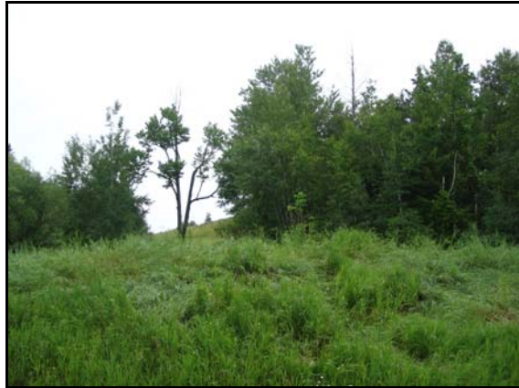
Plate 14: View to northeast, grass-covered berm in foreground surrounds existing facility. Edge of landfill hill rises behind trees.