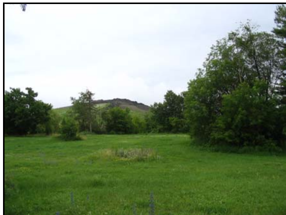
Plate 8: View to southwest, small area of remnant agricultural landscape with archaeological potential.