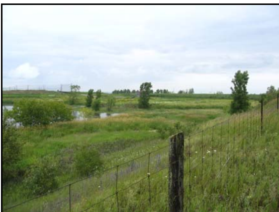
Plate 11: View to north-northeast from berm along southeast edge of existing WM facility. Stormwater management leachate ponds in distance.