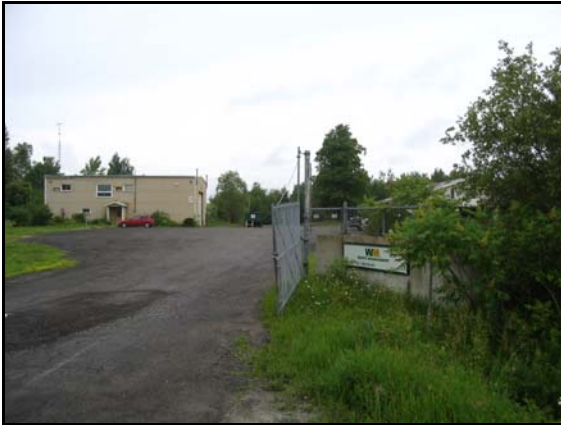
Plate 13: View to northeast, rear entrance of SM facility.