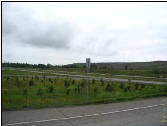
Plate 10: View to west across Hwy 417 from Carp Road. Note berm along southeast edge of existing facility and landfill hill.