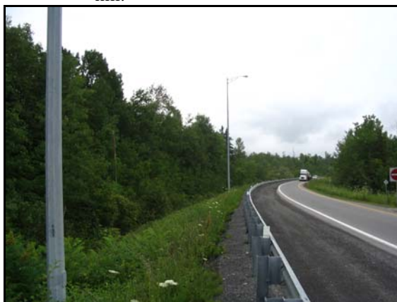
Plate 12: View to east along ramp from Hwy 417. Adjacent ditch and lands are disturbed and wet.