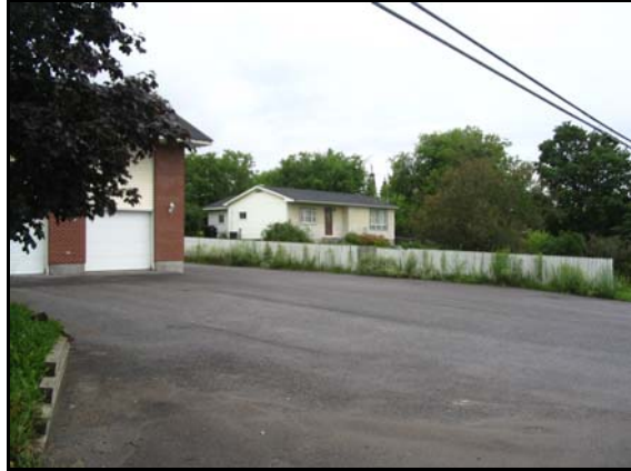
Plate 6: View to west from Carp Road. Modern residences adjacent to road south of factory.