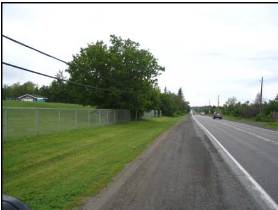
Plate 9: View to southeast along Carp Road near main entrance to WM facility. Disturbed ROW and adjacent lands.