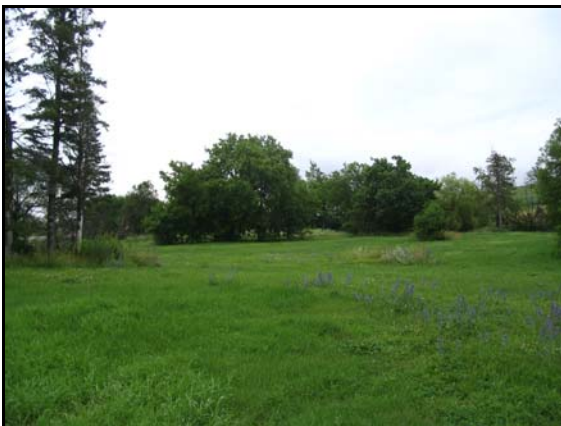
Plate 7: View to southeast, small area of remnant agricultural landscape. Carp Road at left.