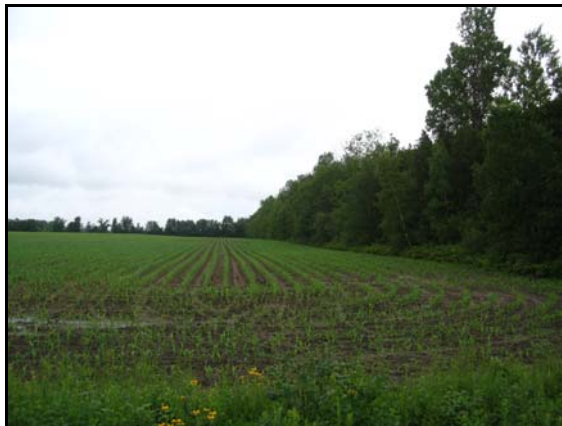
Plate 2: View to northeast from W. Mooney Rd. Woodlot edged by cedar and stone fence. Low rise at left of photo. Similar to landscape west of road.