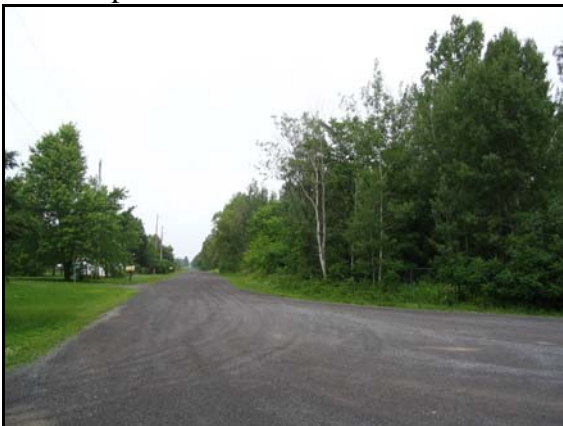
Plate 1: View to northwest along Wm Mooney Rd bordered by some modern residential properties. Note dips in road at drainage ditches.