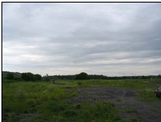
Plate 4: View to southwest across graded land behind factory. Fields in background are undisturbed.