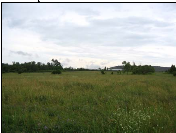
Plate 3: View to southeast across open fields edged by tree lines. Factory roof and landfill hill in background.